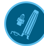
Waterproof Splice Kit