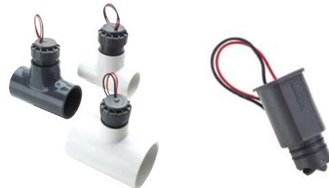
Impeller-type flow sensor, requires FCT fitting for pipe installation (order separately)